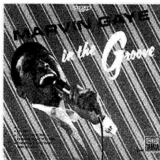
2. Marvin Gaye 571